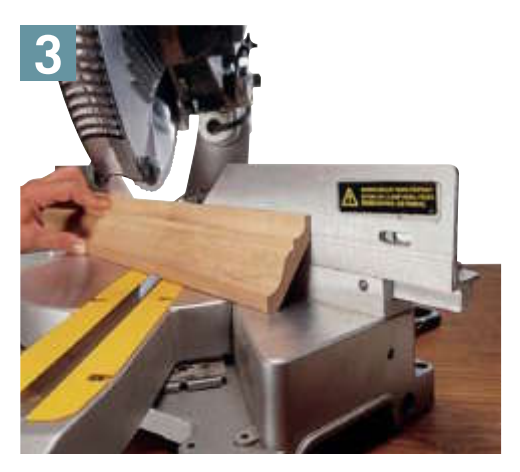
A tall fence makes it easier to cut crown molding.

Angle and bevel indicators should be easy to read. Hairline cursors are the best.